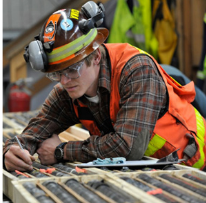
Hecla Mining - Greens Creek Mine

Timely updates of the Alaska Claims Mapper will enable companies to see what lands are available for exploration and will foster increased investment in Alaska's mineral industry.