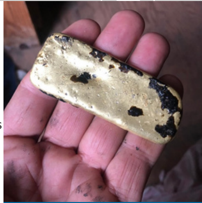
Alaska Minerals Commission Alaska Placer

The Alaska Minerals Commission recommends that the Governor and the Legislature continue to fund and support the DNR's Public Access Assertion and Defense Unit's mission to pursue corridors across all public lands, as appropriate, to ensure everyone can legally access the land and its mission to protect and defend state title submerged lands under navigable waters statewide.