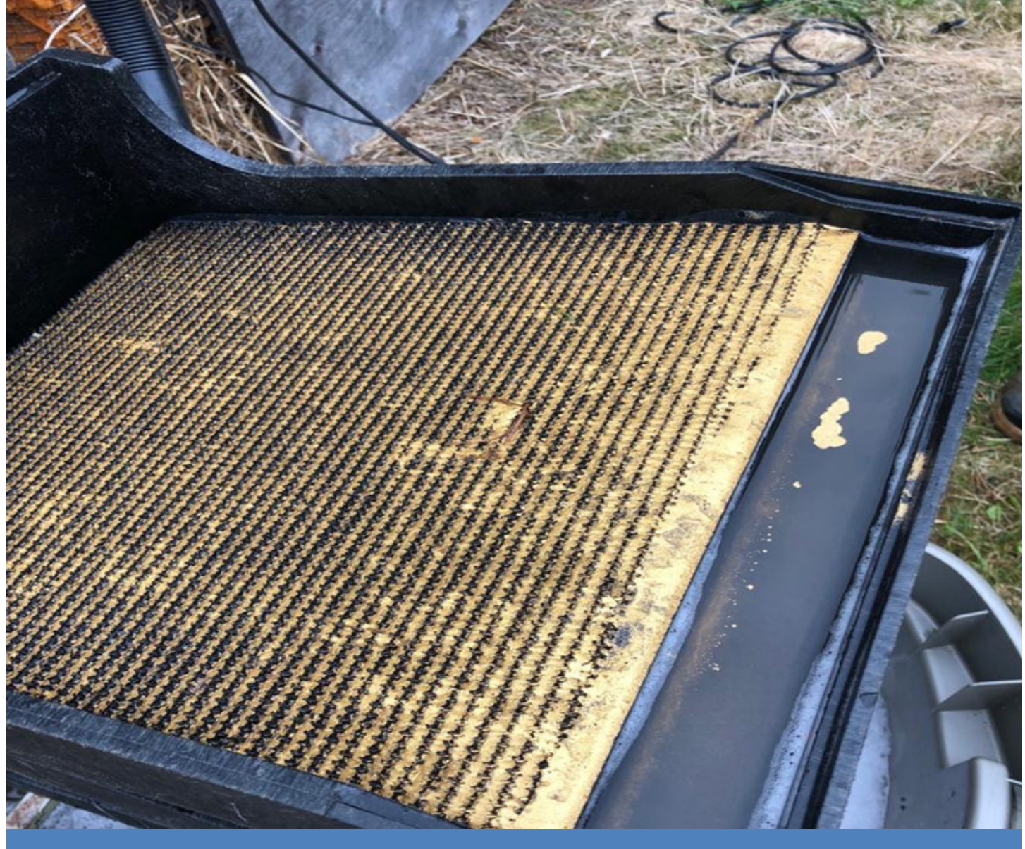
Gold Sluice – Alaska Minerals Commission

The Mineral Commission would like to thank the Governor's Office for having every agency review budgets to see where progress and efficiencies could happen, while also maintaining a strong regulatory permitting program necessary to manage responsible mineral development and maintain access to critical mineral resources.