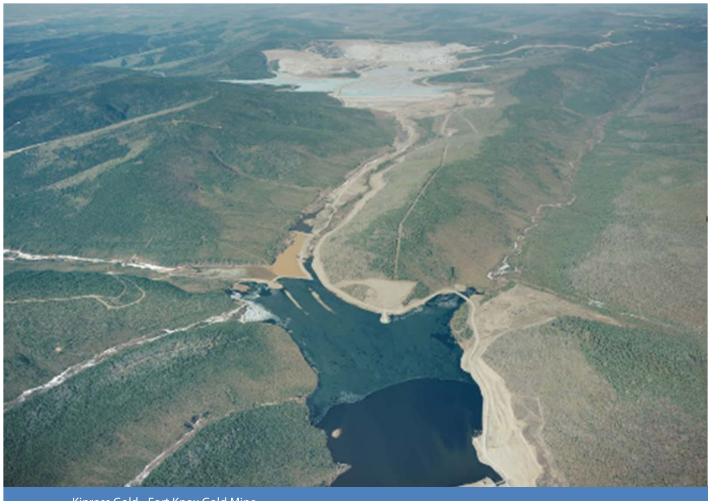
Kinross Gold - Fort Knox Gold Mine

The Alaska Minerals Commission recommends pursuing reforms to limit the use and impact of ballot measures affecting natural resources policy. The late Senator Birch championed a bill, SB 80, that would bring greater accountability to the process by limiting severance. The Alaska Minerals Commission recommends support for SB 80 when it is considered in the House during the 2020 legislative session.