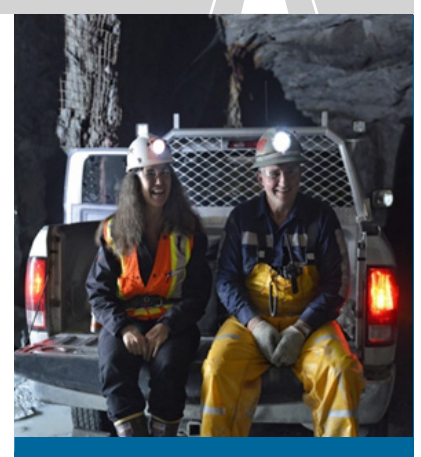
Coeur Mining - Kensington Mine

The Alaska Minerals Commission recommends that the State of Alaska continue to monitor and support federal legislation that defines WOTUS according to the intent of the Clean Water Act and limits federal agency jurisdiction of navigable waters.