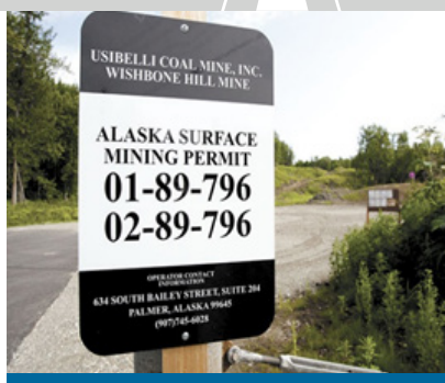
Usibelli - Wishbone Hill Coal Mine

The Alaska Minerals Commission recommends that the proposed legislation to establish that Tier 3 designation authority resides with the Alaska Legislature be passed during the 2020 legislative session. This will assure the most objective decision-making process for designation of Tier 3 waters.